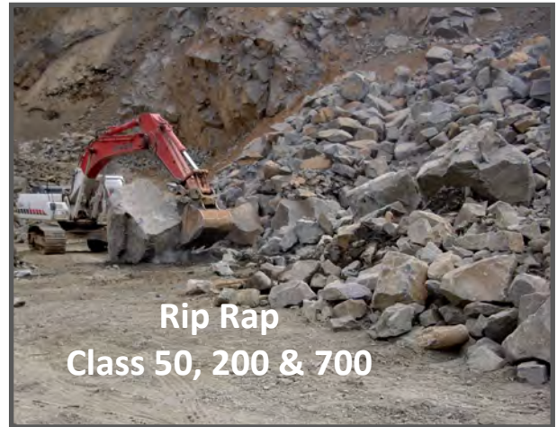
Rip Rap Class 50, 200 & 700