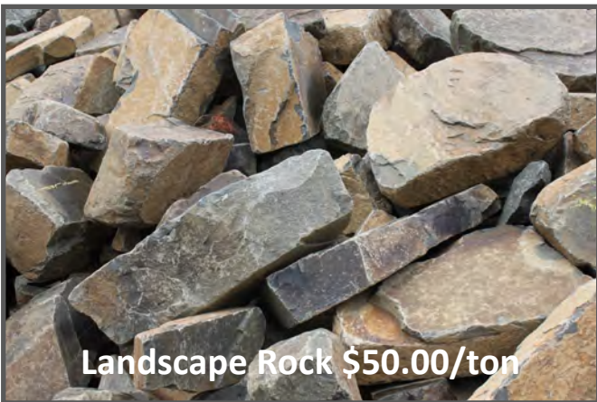
Landscape Rock $50.00/ton