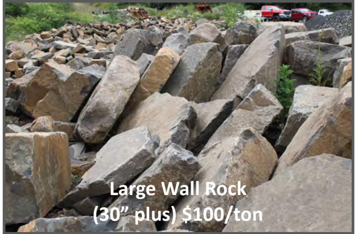
Large Wall Rock (30" plus) $100/ton