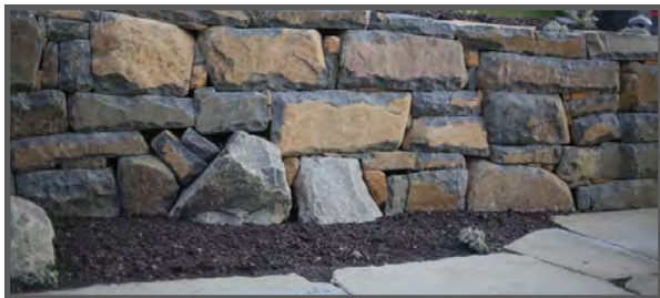
Hand Stack Wall Rock (18"-30" 2 man) $0.10/lbs